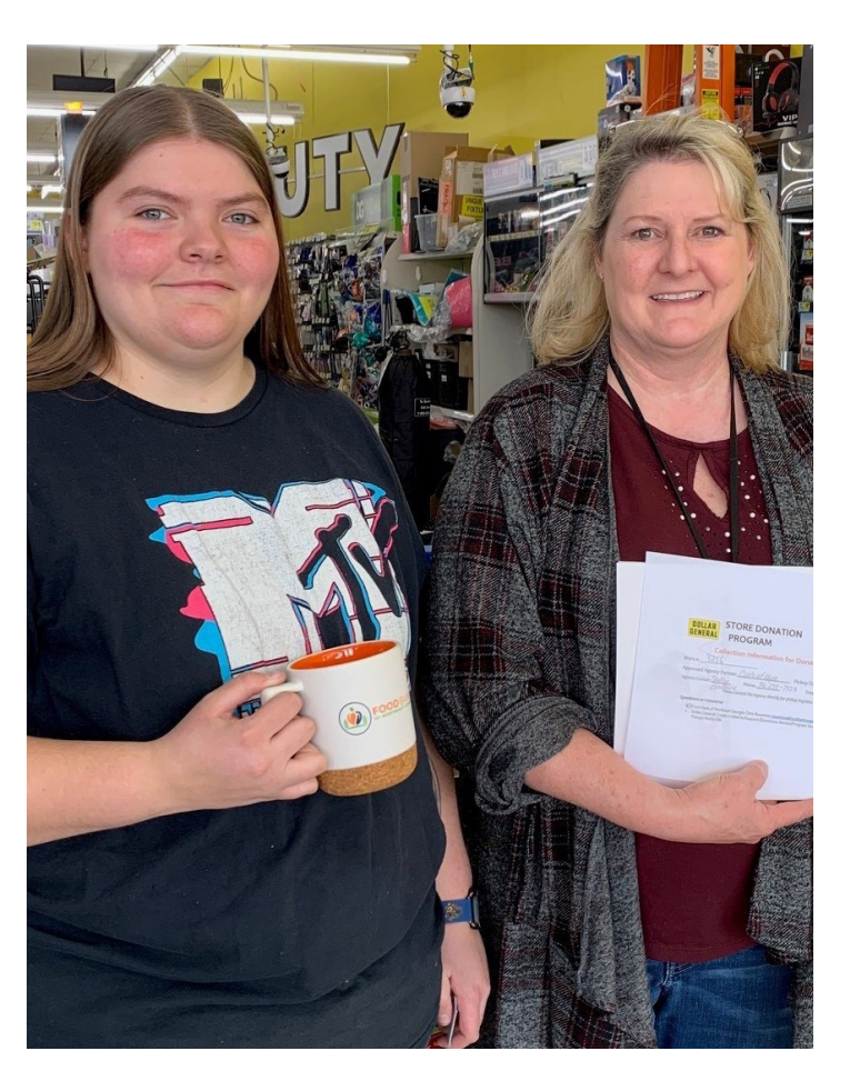
Dollar General is a retail rescue partner for a number of Food Bank Members.

Launching this program on January 29, 2024, the Food Bank connected 40 Member organizations with more than 90 retail donors. By June 30, 2024, Members reported over 200,000 pounds of food rescued. The Food Bank has invested in this initiative by providing coolers, freezer blankets, thermometers, scales, and food sourcing carts and bins to Members and retail donors. "Now that the program has been established, we're trending at about 50,000 pounds